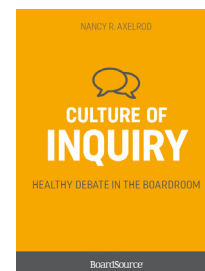
Culture of Inquiry