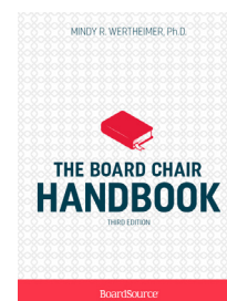
The Board Chair Handbook